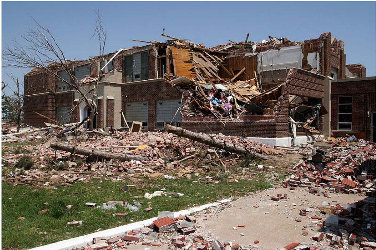
Figure 2: Greensburg High School, Greensburg, Kansas, Fujita 5 tornado, May 4, 2007, at http://commons.wikimedia.org/wiki/File:FEMA - 30070 - Greensburg High School tornado damage in Kansas.jpg

important to note that unlike seismic events, where advanced instrumentation exists to make precise measurements of acceleration and ground motion, severe tornado velocities are a matter of expert estimates rather than precise measurements. One can therefore reasonably expect changes in the science and in the expert estimates in the future. 14 The estimates of the modest amounts of hydrogen that produced catastrophic damage and the evolving understanding of tornadoes requires a complete and thorough reevaluation of the assumption that Mark I secondary containment buildings are tornado survivable.